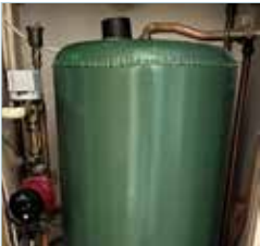
Hot water tank jacket Install a new super-insulated jacket around older hot water tanks.