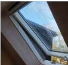
Skylight. Install high performance skylights with external blinds to control heat loss and solar gain.