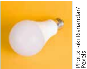
Low energy lighting. LEDs are 70% more efficient than traditional light bulbs.